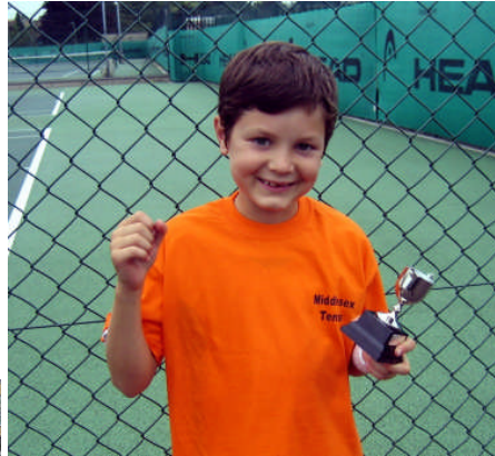
That winning feeling (aged 9)